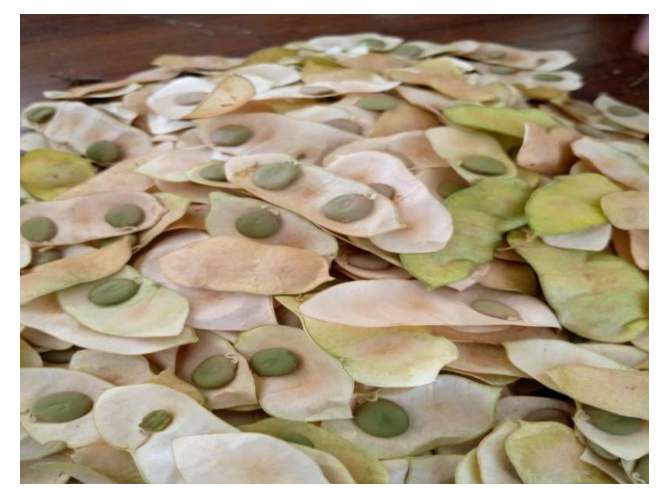
Figure 2 S. mellifera pods and seeds

germination in S. mellifera . The study's goals included measuring the size and weight of seeds, as well as testing various scarification methods on germination.