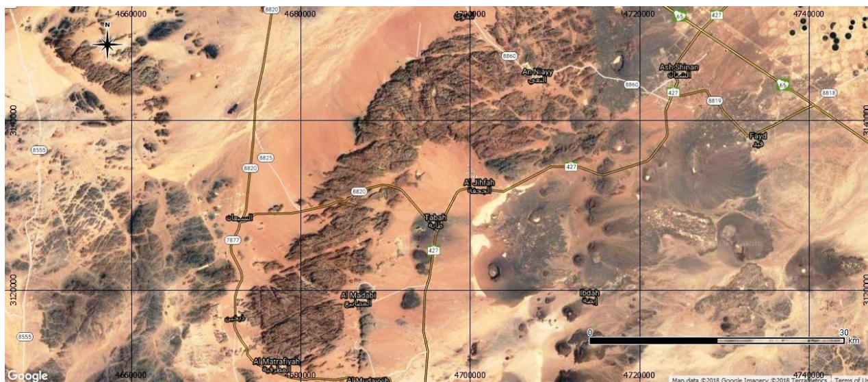
Figure 1 Map showing the study area of Salma Mountains (Map created using QGIS v.2.18.14).