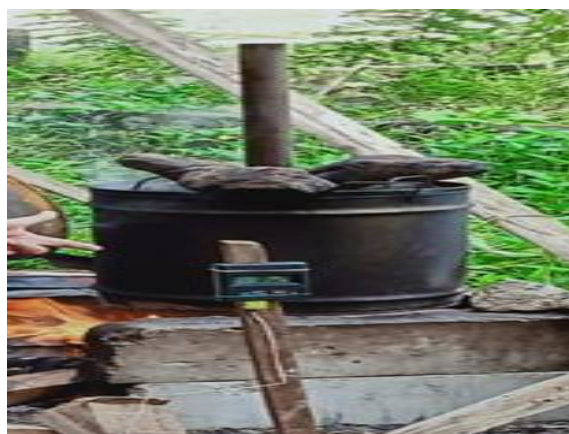
Figure 2 Drum and Temperature Measuring Equipment for Making OPEFB Biochar