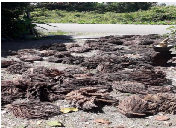
Figure 1 Oil Palm Empty Fruit Bunches