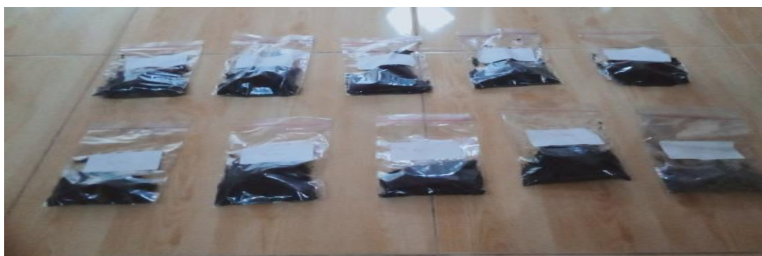
Figure 3 Oil Palm Empty Fruit Bunch Biochar

The main biomass components, including hemicellulose, cellulose, and lignin, were degraded during combustion. Each biomass directly influences the yield and characteristics of the resulting